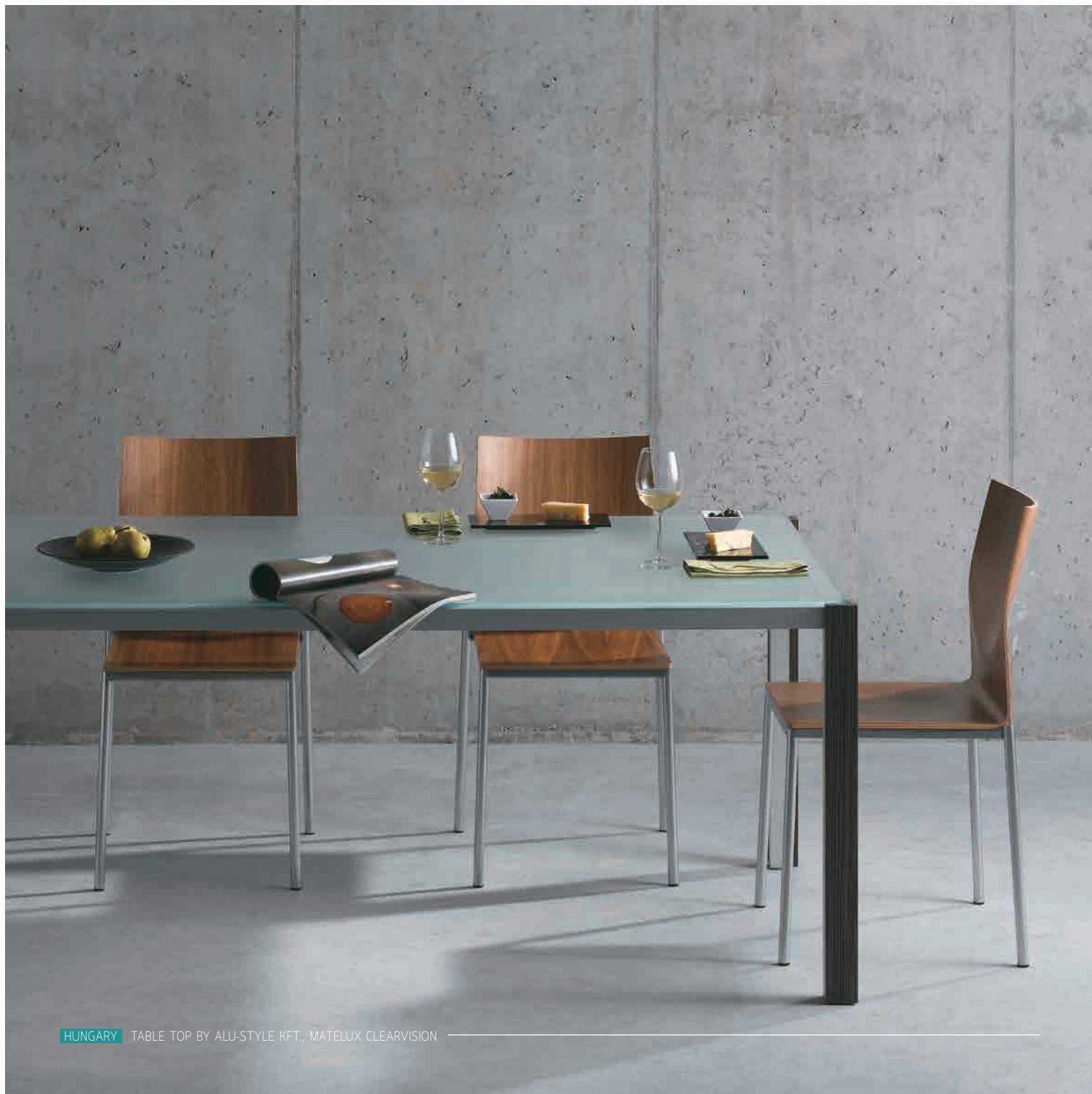
HUNGARY TABLE TOP BY ALU-STYLE KFT., MATELUX CLEARVISION