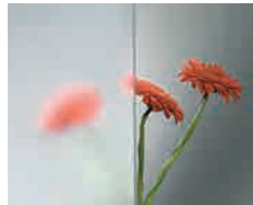
Clearvision Highly transparent float base for pure aesthetics