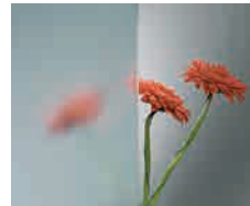
Linea Azzurra Slightly blue tinted float base