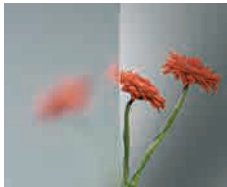
Clear Normal float base